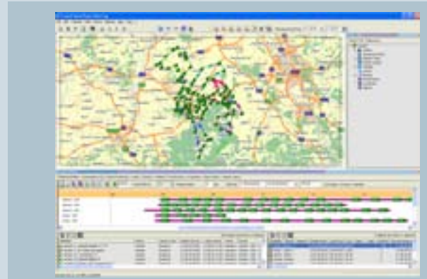
Planning GUI of Transport & Route Management